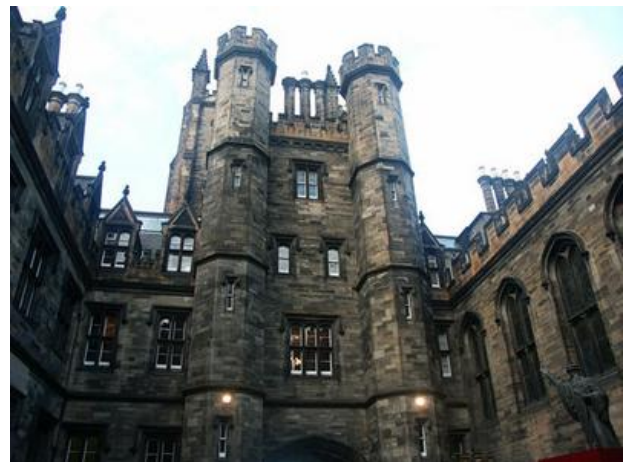
New College Edinburgh were Chalmers taught from 1828-1843.

We know not a more sweeping interdict upon the affections of nature, than that which is delivered by the apostle in the verse before us. To bid a man into whom there is not yet entered the great and ascendant influence of the principle of regeneration, to bid him withdraw his love from all the things that are in the world, is to bid him give up all the affections that are in his heart. The world is the all of a natural man. He has not a taste, nor a desire, that points not to a something placed within the confines of its visible horizon. He loves nothing above it, and he