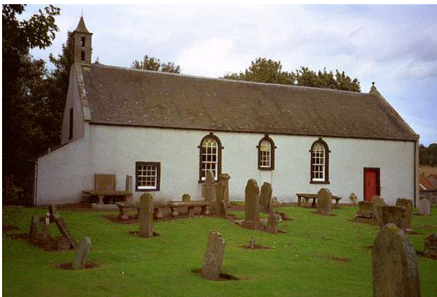
Not far from St. Andrews, Chalmers' first church at Kilmany.

abandonment. A sensitive being suffers, and is in violence, if, after having thoroughly rested from his fatigue, or been relieved from his pain, he continue in possession of powers without any excitement to these powers; if he possess a capacity of desire without having an object of desire; or if he have a spare energy upon his person, without a counterpart, and without a stimulus to call it into operation. The misery of such a condition is often realized by him who is retired from business, or who is retired from law, or who is even retired from the occupations of the chase, and of the gaming-table. Such is the demand of our nature for an object in pursuit, that no accumulation of previous success can extinguish it—and thus it is, that the most prosperous merchant, and the most victorious general, and the most fortunate