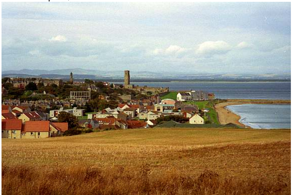
St. Andrews: the seedbed of Chalmers' discipleship ministry.

nature at command, now look upon all that is around them with an eye of tastelessness; who, plied with the delights of sense and of splendor even to weariness, and incapable of higher delights, have come to the end of all their perfection, and, like Solomon of old, found it to be vanity and vexation. The man whose heart has thus been turned into a desert can vouch for the insupportable languor which must ensue, when one affection is thus plucked away from the bosom, without another to replace it. It is not necessary that a man receive pain from anything, in order to become miserable. It is barely enough that he looks with distaste to everything, and in that asylum which is the repository of minds out of joint, and where the organ of feeling as well as the organ of intellect has been impaired, it is not in the cell of loud and frantic outcries where you will meet with the acme of mental suffering; but that is the individual who outpeers in wretchedness all his fellows, who throughout the whole expanse of nature and society meets not an object that has at all the power to detain or to interest him; who neither in earth beneath, nor in heaven above, knows of a single charm to which his heart can