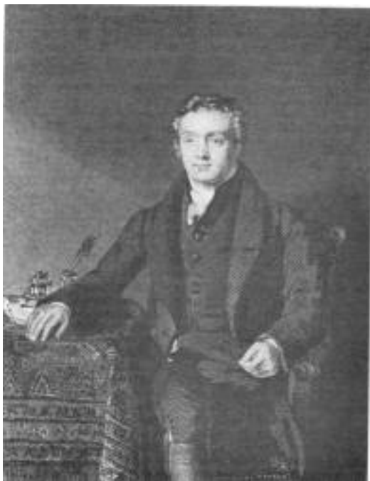
Chalmers in the prime of his ministry.

We hope that by this time you understand the impotency of a mere demonstration of this world's insignificance. Its sole practical effect, if it had any, would be to leave the heart in a state which to every heart is insupportable, and that is a mere state of nakedness and negation. You may remember the fond and unbroken tenacity with which your heart has often recurred to pursuits, over the utter frivolity of which it sighed and wept but yesterday. The arithmetic of your