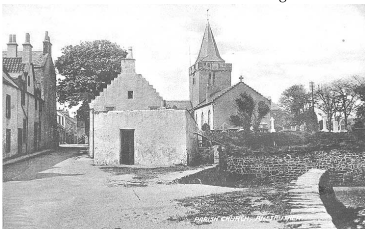
The Parish Church in Chalmers' hometown of Anstruther.

a state of indulgence. Under the impulse of desire, man feels himself urged onward in some path or pursuit of activity for its gratification. The faculties of his mind are put into busy exercise. In the steady direction of one great and engrossing interest, his attention is recalled from the many reveries into which it might otherwise have wandered; and the powers of his body are forced away from an indolence in which it else might have languished; and that time