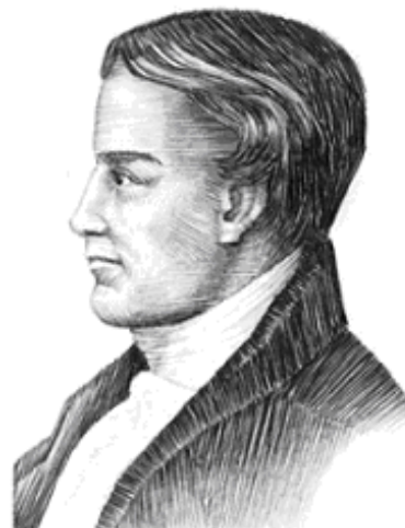
Robert Murray M'Cheyne: another of Chalmers' spiritual sons.

the New Testament to be beneath their attention. Neither they nor anyone else can dispossess the heart of an old affection, but by the impulsive power of a new one—and, if that new affection be the love of