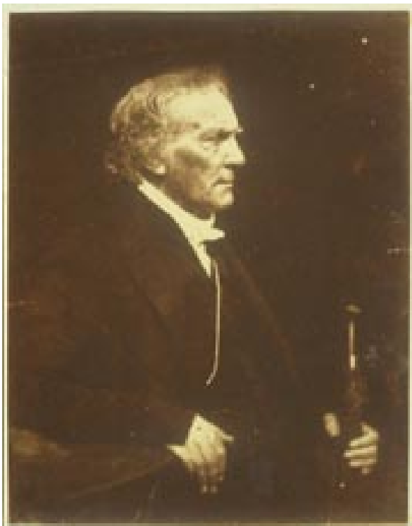
Always a shepherd, ever intentional, Chalmers was passionate about ministering to the body, mind, and soul of his flock.

indispensable to the deliverance of our persons from the hand of justice than it is to the deliverance of our hearts from the chill and the weight of ungodliness. Retain a single shred or fragment of legality with the gospel, and you raise a topic of distrust between man and God. You take away from the power of the gospel to melt and to conciliate. For this purpose the freer it is the better it is. That very peculiarity which so many dread as the germ of Antinomianism, is, in fact, the germ of a new spirit and a new inclination against it. Along with the lights of a free gospel does there enter the love of the gospel, which, in proportion as you impair the freeness, you are sure to chase away. And never does the sinner find within himself so mighty a moral transformation as when, under the belief that he is saved by grace, he feels constrained thereby to offer his heart a devoted thing, and to deny ungodliness.